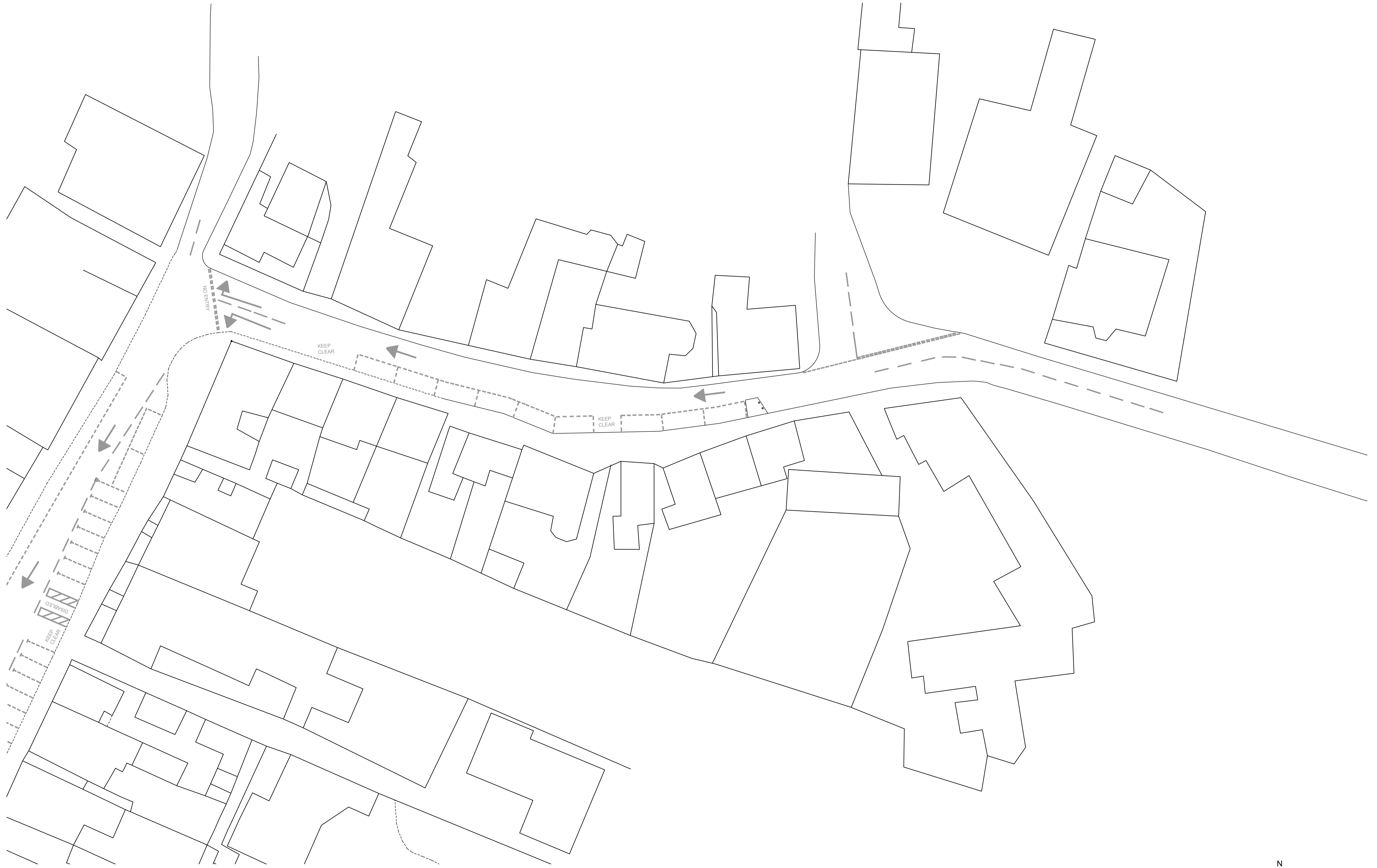
Proposed Layout Plan 1:250